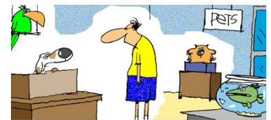
"Pick me. I'm house trained, quiet and I've taken some computer classes. So if you need help with your software, I can help."

rising. Run, romp and play daily. Avoid biting when a simple growl will do. On warm days, stop to lie on your back on the grass. On hot days, drink lots of water and lie under a shady tree. When you're happy, dance around and wag your entire body. Delight in the simple joy of a long walk. Eat with gusto and enthusiasm; stop when you have had enough. Be loyal. Never pretend to be something you're not. When someone is having a bad day, be silent, sit close by and nuzzle them gently. If what you want lies buried, dig until you find it.