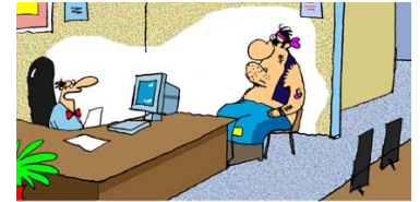
"We here at Computer Inc. would like to change our nerdy image. That's where you come in."